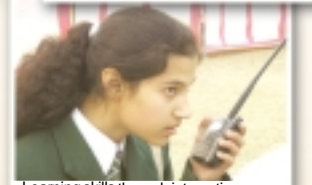
Learning skills through interaction